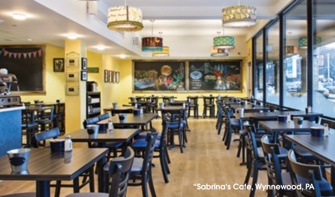
"Sabrina's Cafe, Wynnewood, PA"