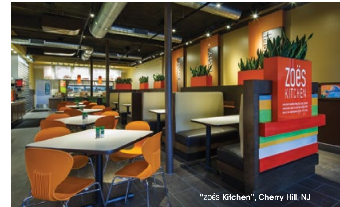
"zoës Kitchen", Cherry Hill, NJ