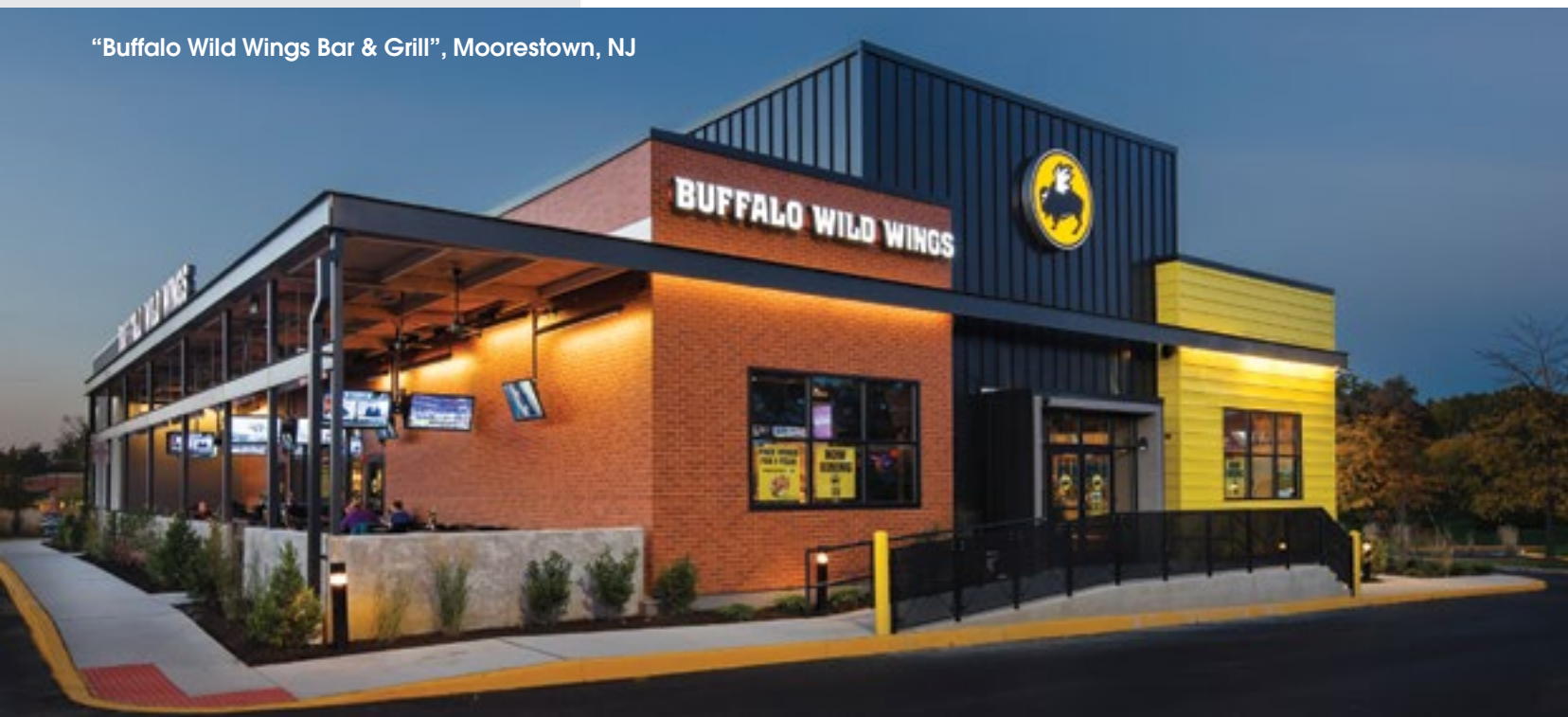
"Buffalo Wild Wings Bar & Grill", Moorestown, NJ

TBG recommends: Try the "Tossed Greek Salad" or the "Grüben" sandwich