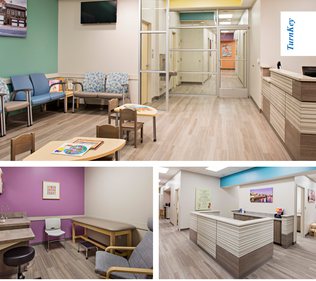
"Advocare Broomall Pediatrics" Broomall, PA (all above)

interior fit out was divided into two separately functioning offices – a primary care facility and an imaging center - each with its own waiting area and check-in counter. The project also included 3 different types