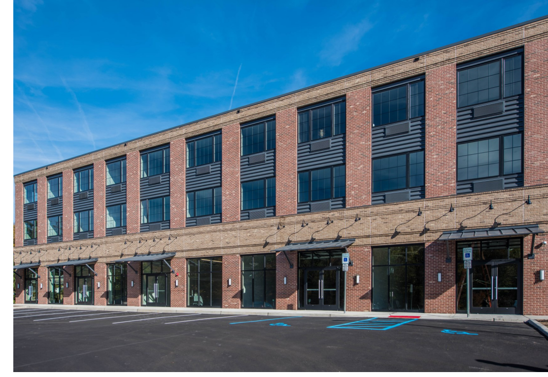
"Woodcliff Lake Commons" Woodcliff Lake, NJ (front cover, left and above)