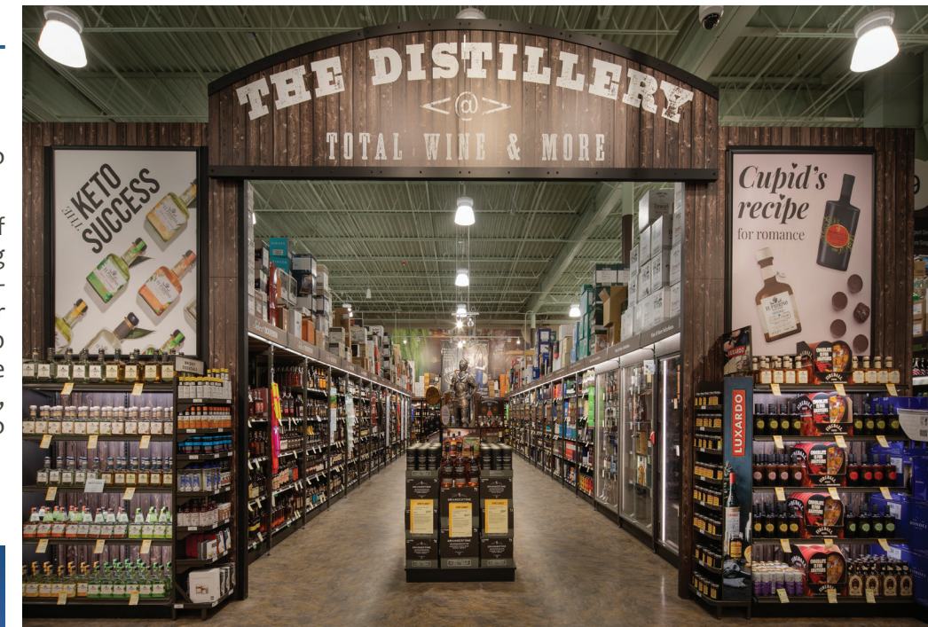
"Total Wine Fit Out" Eatontown, NJ (above)