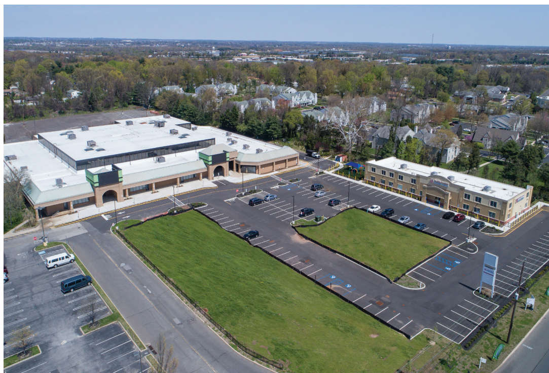
"Party City Fit Out" Eatontown, NJ (below)

Additionally, part of the shopping center renovation included a new 12,068 square foot Party City store which was constructed utilizing a vacant section of an occupied Best Buy. The fit out also featured landlord renovations to prepare the space, new roof top HVAC units, along with facade renovations and a new storefront. These stores are just two components of a full shopping center overhaul that incorporated renovations of multiple storefront facades, construction of two new pad sites and updated site work across the entire center.